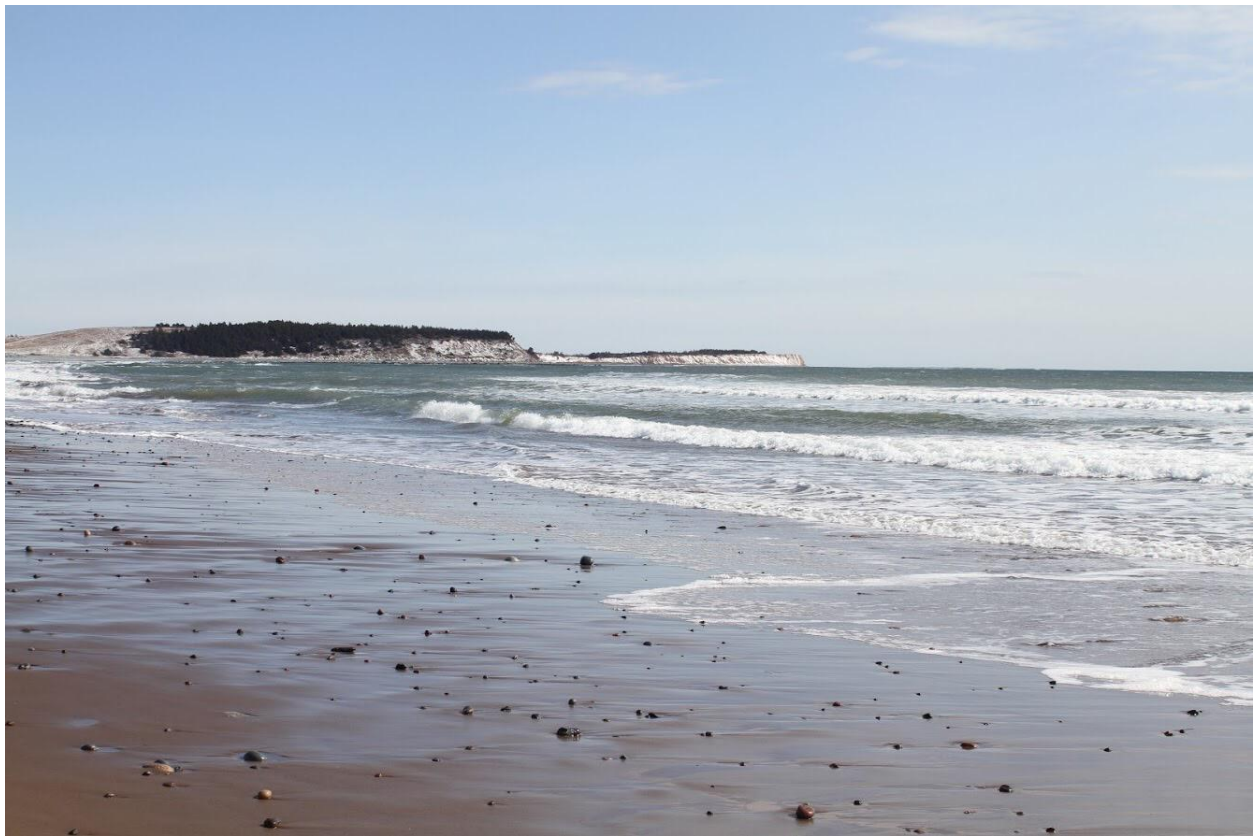
Lawrencetown Beach, Nova Scotia, March 2020