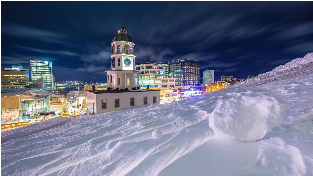
Citadel Clock, Halifax, Nova Scotia